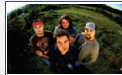
The Davisson Brothers Band May 28 @ Palatine Park Amphitheatre - 8 p.m. 11 p.m. - Carnival & Festival Closes

The Davisson Brothers Band 8 p.m. - Palatine Park Amphitheatre