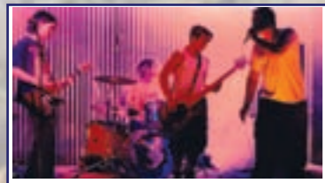
Last Band Standing Preliminaries: May 23 @ De Lazy Lizard - 1 p.m.