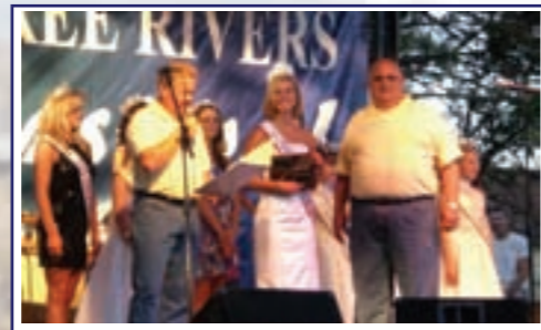
2010 Opening Ceremonies May 27 @ Palatine Park Amphitheatre - 7:30 p.m.

6-10 p.m. - One Price Armband Opening Ceremonies 7:30 p.m. - Palatine Park Amphitheatre