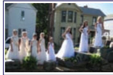
Grand Feature Parade May 27, Downtown Fairmont - 6 p.m.

5 p.m. - Carnival & Festival Opens Grand Feature Parade 5 p.m. - Line-up 6 p.m. - Parade